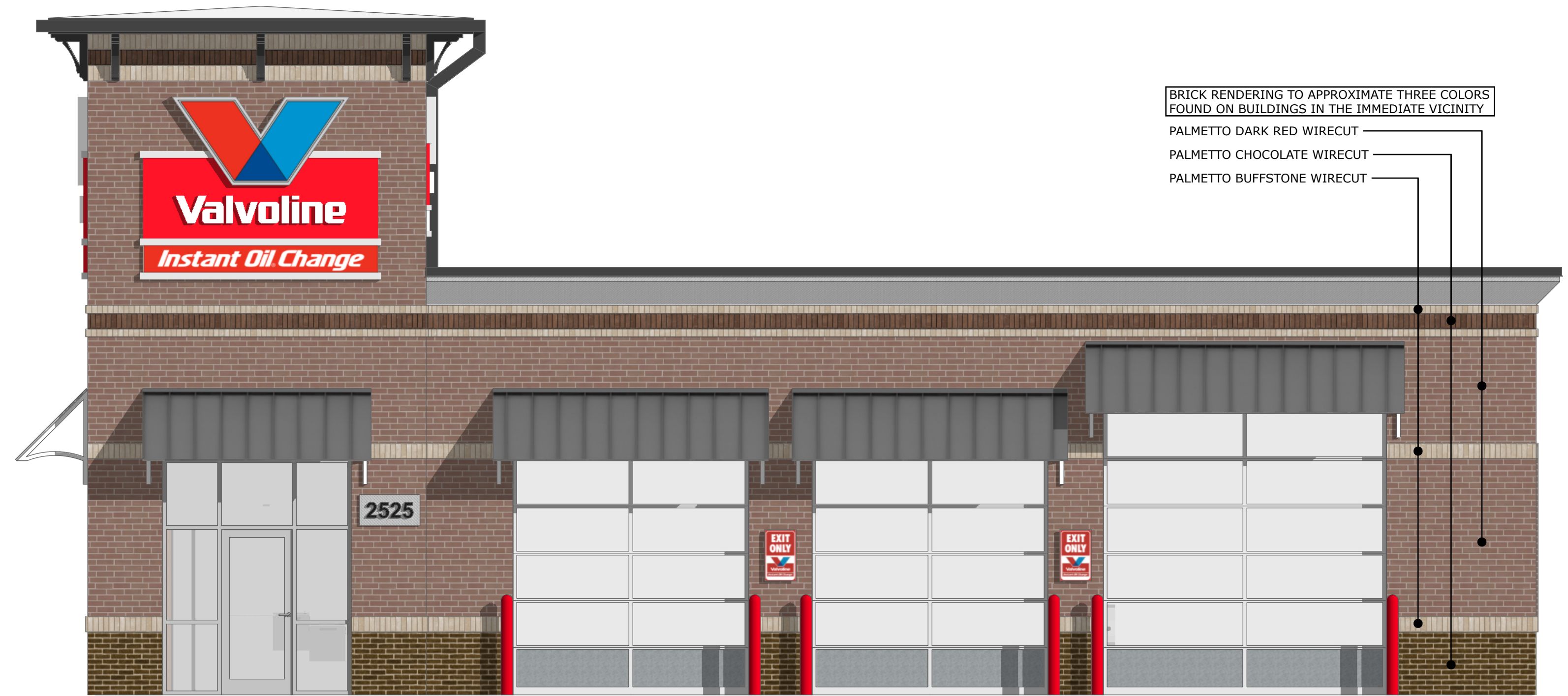
A FRONT - CUTHBERTSON RD. Scale: 1/4" = 1'