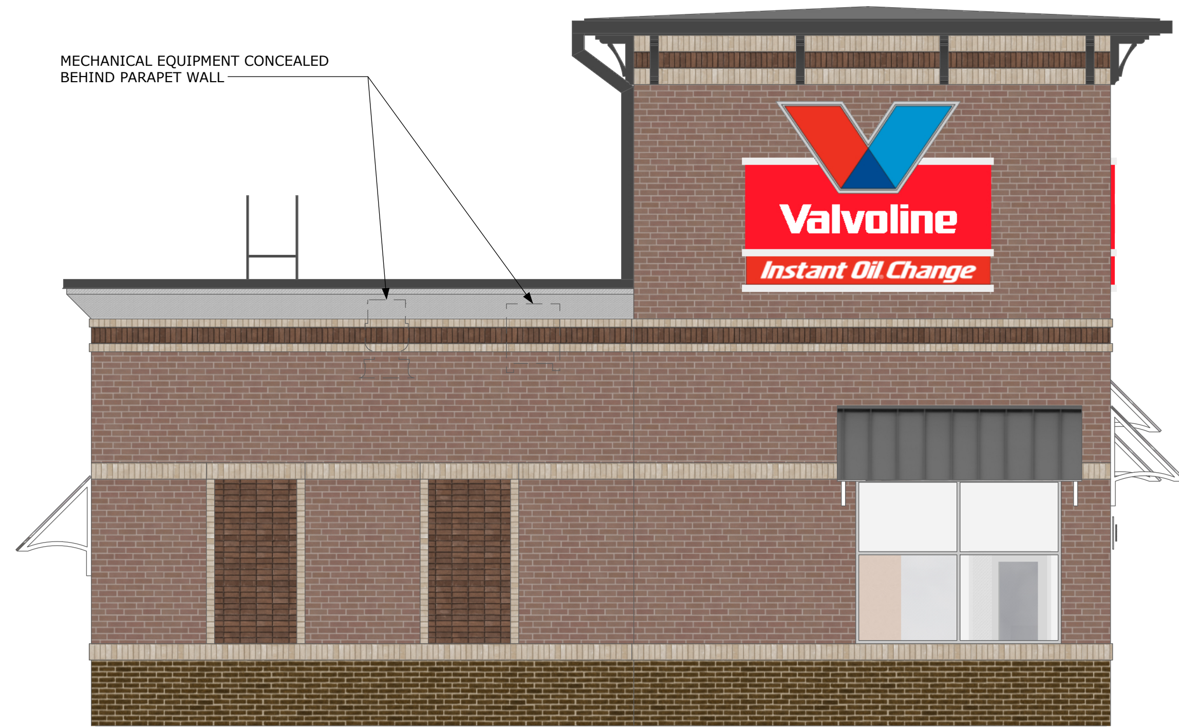
B LEFT Scale: 1/4" = 1'

08-02-21 per Town comments, change brick to match surrounding, add separation to awnings, show hollow metal and utilities painted to match masonry.